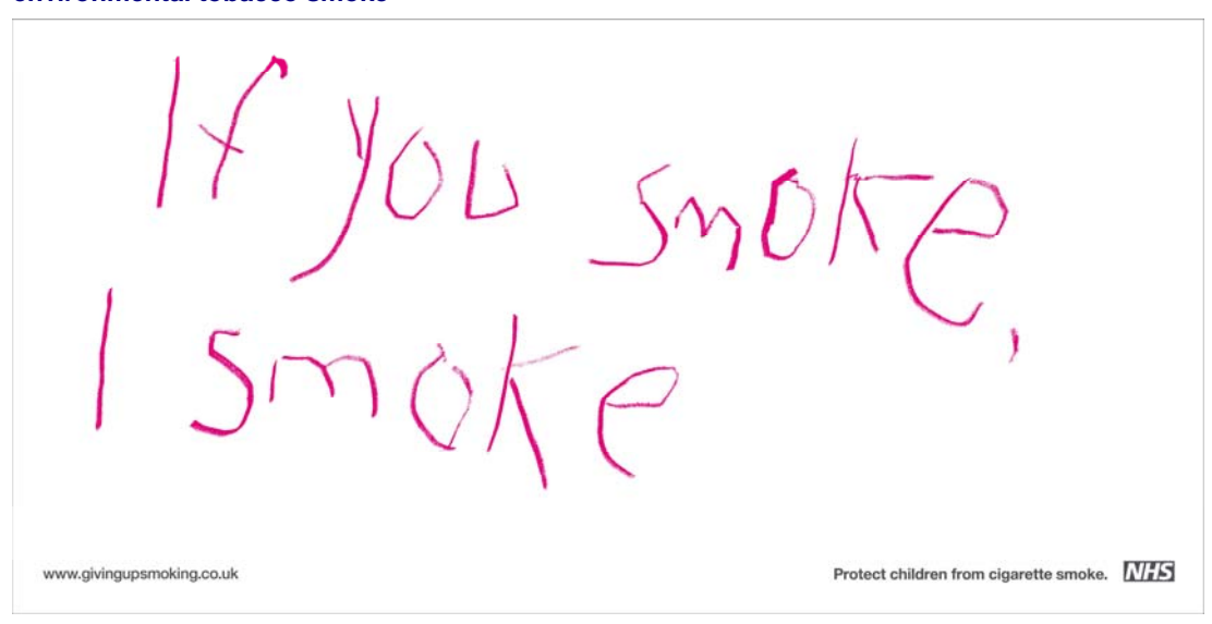
FIGURE 4.1 Public health advertisement aimed at reducing children's exposure to environmental tobacco smoke

Deaths from carbon monoxide exposure amongst children have declined substantially over the past ten years and now there are fewer than ten deaths per year (HPA, 2007a). However, there is evidence of a lack of awareness of the dangers of carbon monoxide exposure amongst the general public in the UK and potentially an increasing problem in vulnerable groups. Recently concern has been raised about the potential for chronic carbon monoxide poisoning in home environments that may be undetected and unreported (Wright, 2002).