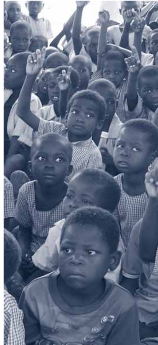
Children confirming haematuria (blood-urine) by show of hands during a schistosomiasis (bilharziasis) education session at a primary school in Bongo, Ghana. Schistosomiasis causes anaemia, stunted growth and a reduced ability to learn among children.

Research – A research strategy is required for the development and implementation of new medicines, particularly for leishmaniasis and trypanosomiasis; new application technologies and products for vector control; vaccines for dengue; and new diagnostics that will be accessible to all who need them.