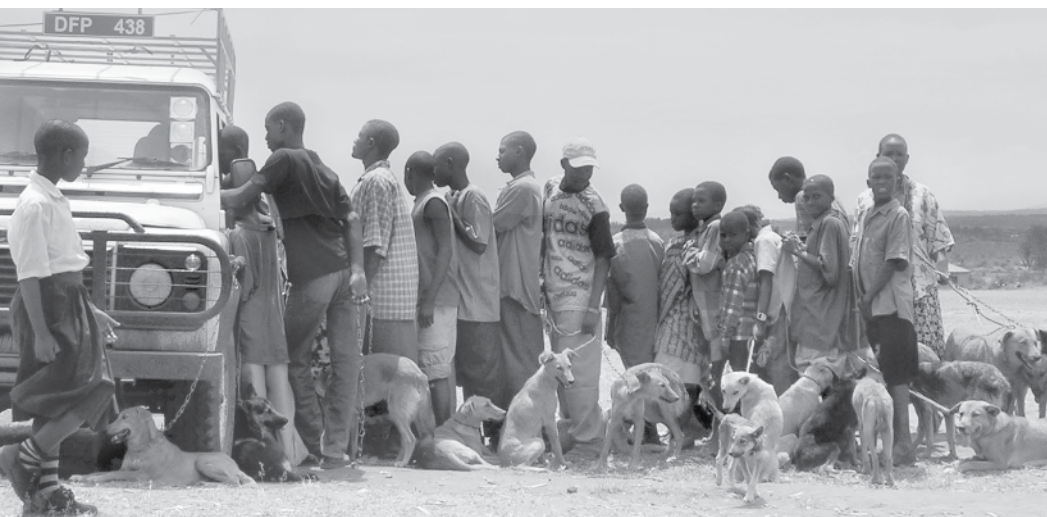
Mass vaccination campaign of dogs, United Republic of Tanzania. Dogs continue to be the main carrier of rabies, particularly in Africa and Asia. Humans most often become infected through the bite or scratch of an infected dog. Mass vaccination of pets helps to prevent occurrence of human rabies.

These diseases can be seen as promoters of poverty which weaken impoverished populations, frustrate the achievement of the health-related Millennium Development Goals and impede global development outcomes. A more reliable evaluation of their significance for public health and economies has convinced governments, donors, the pharmaceutical industry and other agencies, including nongovernmental organizations, to invest in preventing and controlling this diverse, but connected, group of diseases.