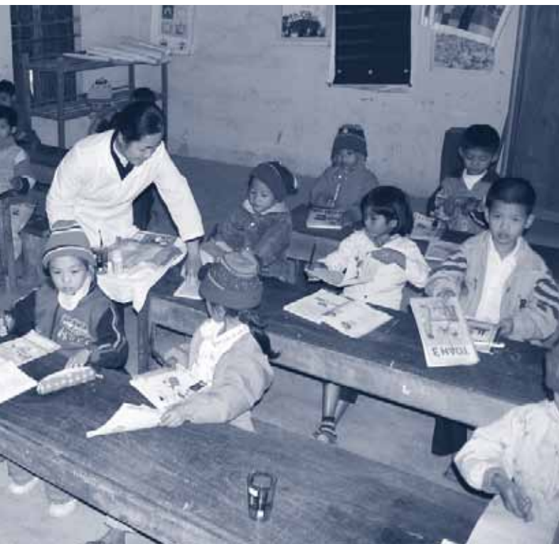
Distribution of mebendazole to school children in Bac Can province in Viet Nam. The use of the school infrastructure to deliver deworming allows a low-cost distribution of medicines and ensures a higher rate of treatment coverage.

This emerging vision was sharpened at a meeting held in Berlin, Germany, in December 2003 at which experts from diverse sectors were convened, including public health, economics, human rights, research, NGOs and the pharmaceutical industry. The meeting set the scene for WHO to move forward in applying the new approach in a strategic policy and to formulate ways of providing poor populations with an effective and comprehensive solution to some of their main health problems. From 2003 to 2007, a framework was developed for a coordinated and integrated mechanism to tackle the neglected tropical diseases.