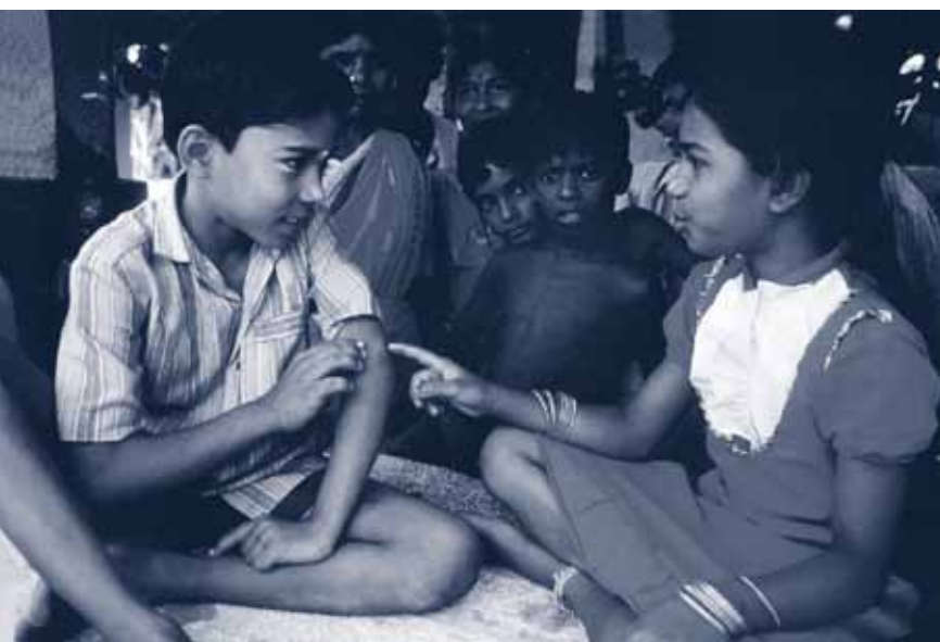
Students discussing leprosy at school in India. Access to information, diagnosis and treatment with multidrug therapy remain key elements of WHO's drive to eliminate leprosy.

The five strategic interventions recommended by WHO (preventive chemotherapy; intensified case-management; vector control; the provision of safe water, sanitation and hygiene; and veterinary public health) make feasible the control, prevention and even elimination of several neglected tropical diseases. Costs are relatively low.